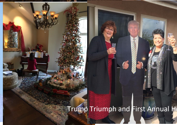
Trump Triumph and First Annual Holiday Celebration 2016