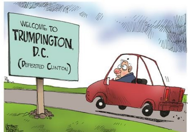
JERRY HOLBERT—JANUARY 4, 2017