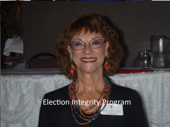
Election Integrity Program