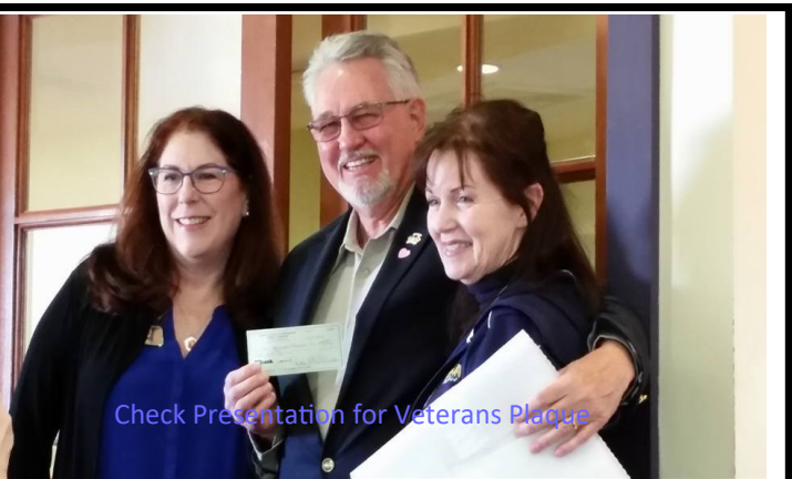
Check Presentation for Veterans Planes