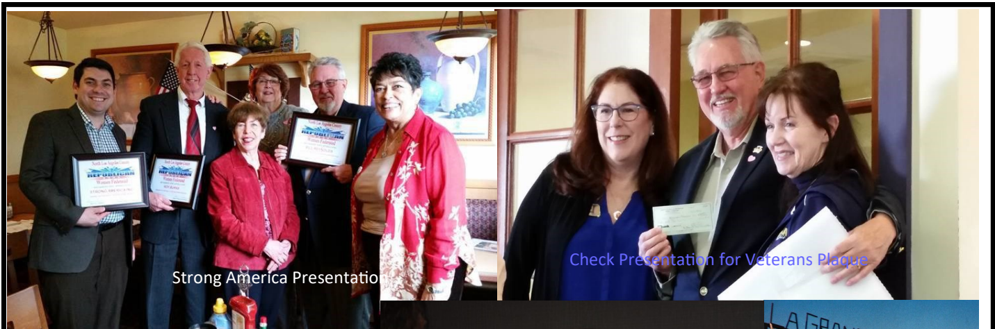
Strong America Presentation